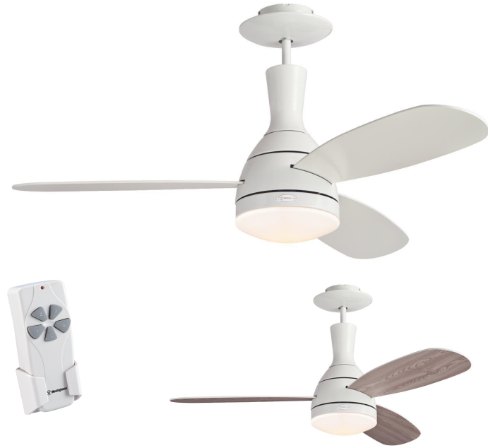
Reversible White Washed Pine Finish Blades